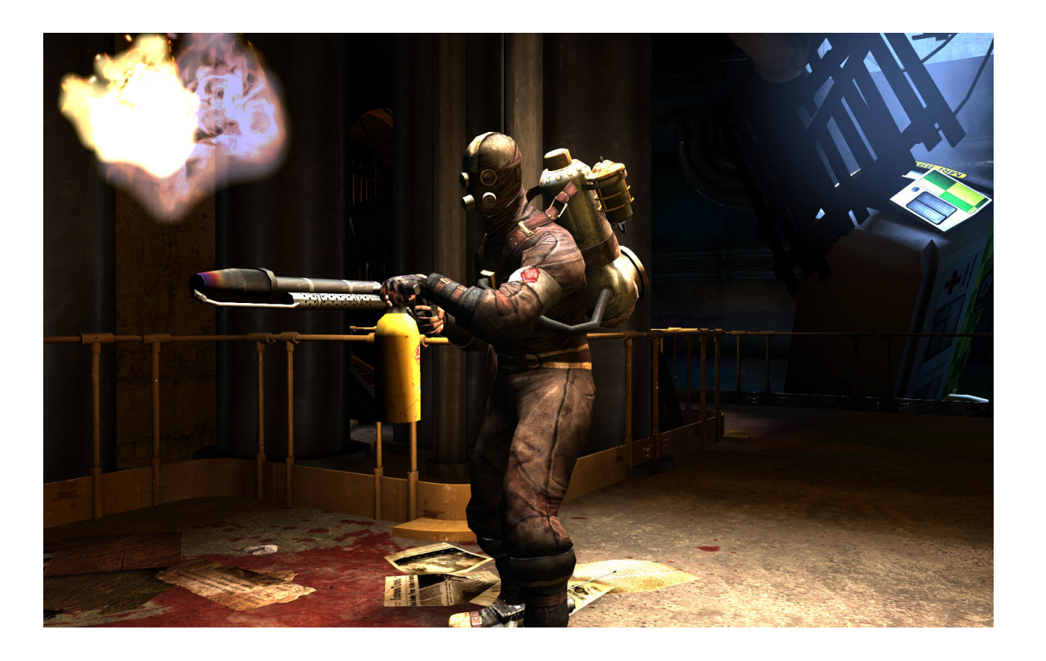
Killing Floor: Steampunk Character Pack Download Uptodown

Download ->>->> <a href="http://bit.ly/2QTK5DG">http://bit.ly/2QTK5DG</a>